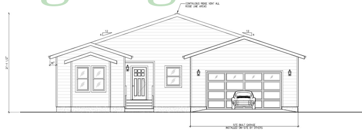
NORTH ELEVATION - FRONT SCALE: 1/4" = 1'-0"