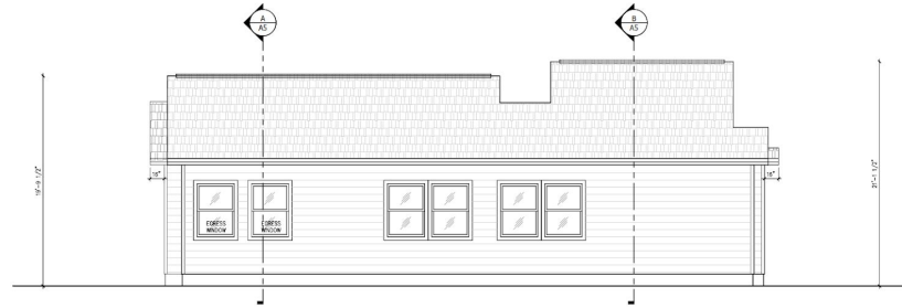
WEST ELEVATION - RIGHT SIDE SCALE: 1/4" = 1'-0"