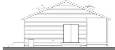
④ LEFT ELEVATION 1/4" = 1'-0"