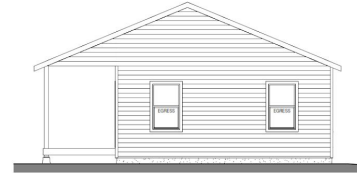
② RIGHT ELEVATION 1/4" = 1'-0"