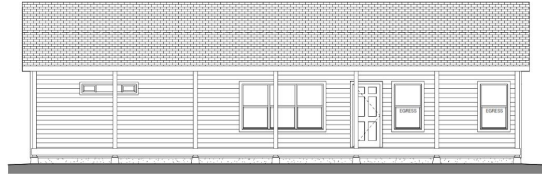
① FRONT ELEVATION 1/4" = 1'-0"